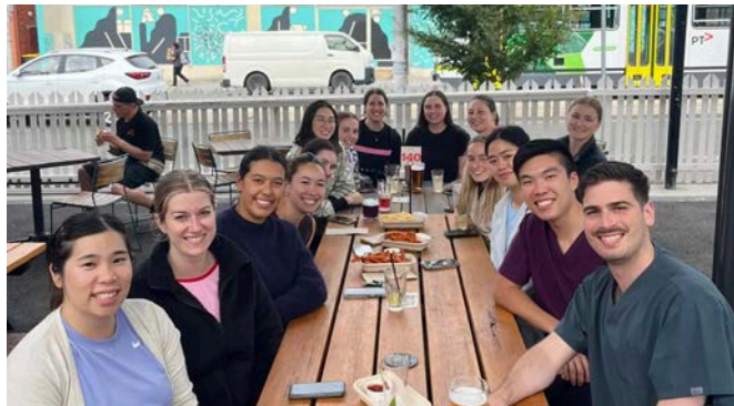
Grade 1 End of Rotation Drinks May 2024

https://www.alfredhealth.org.au/careers/allied-health-workforce/physiotherapy-new-graduate-program