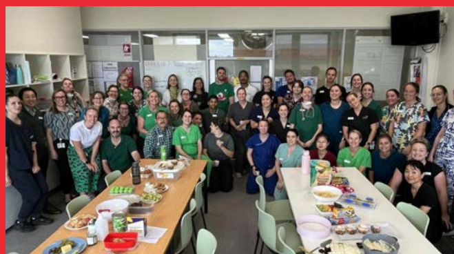
St Patty's Day Morning Tea 2024

Alfred Health's Physiotherapy team is well renowned for its high quality research output which aims to improve patient outcomes, and advance physiotherapy knowledge. Staff are supported for professional development needs and leave. There are many opportunities to participate as a Grade 1 Physiotherapist!